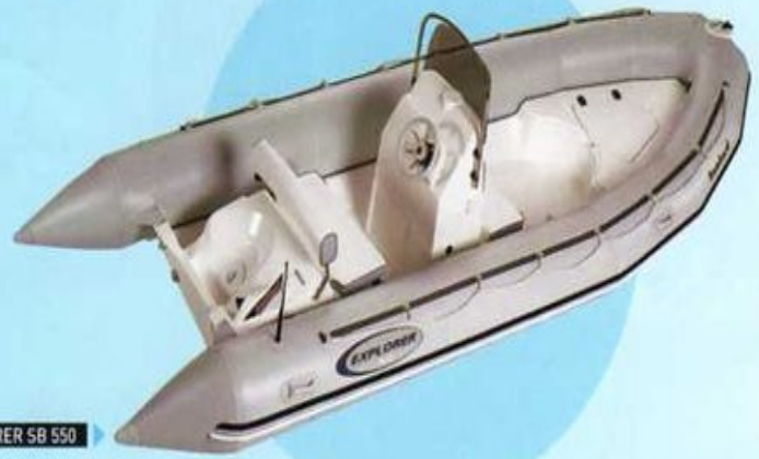
EXPLORER SB 550